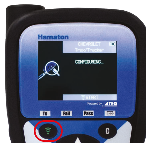
Press the green trigger button