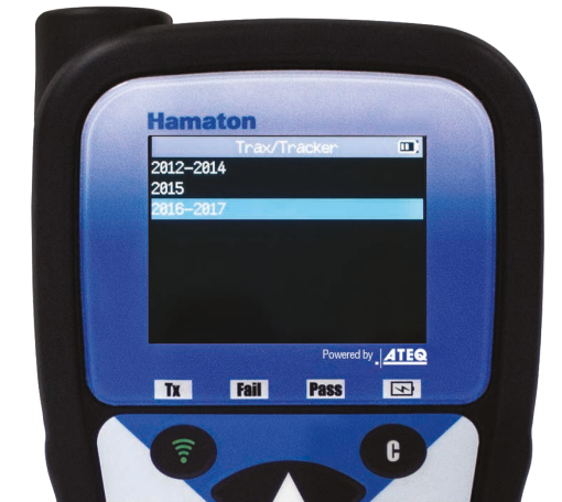
Select the vehicle's YEAR OF MANUFACTURE