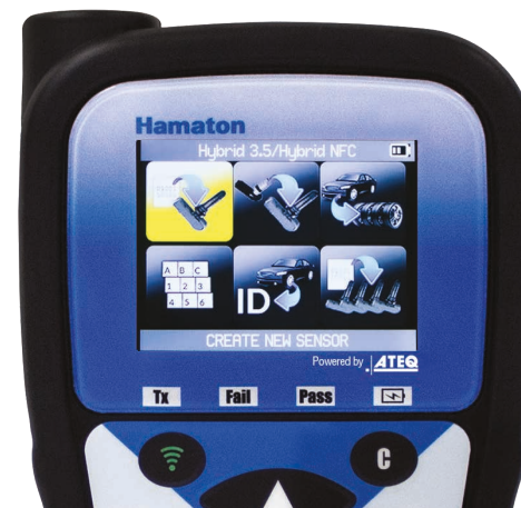
Select CREATE NEW SENSOR