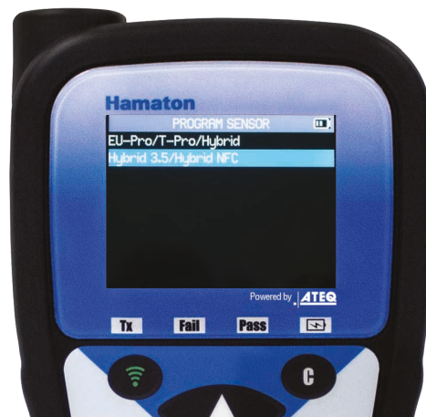
Choose the correct sensor generation N.B. the first option is for Hybrid 1.5 sensors