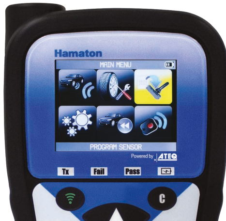
Select PROGRAM SENSOR on the main menu