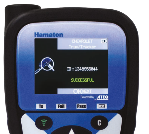
The tool will display SUCCESSFUL if the process was a success