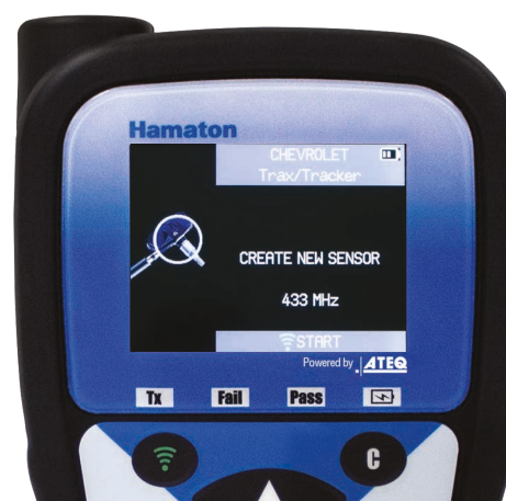
Position the sensor above the tool's antenna