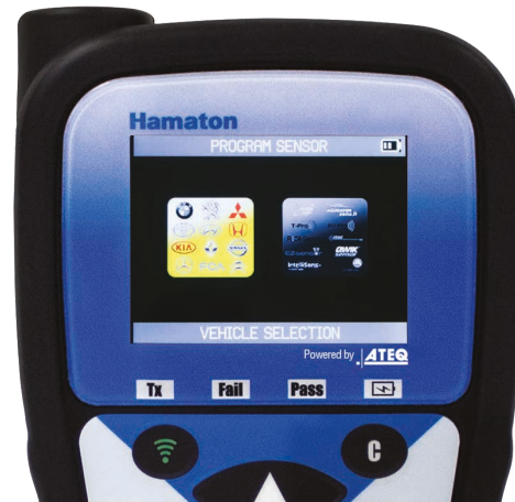
Choose VEHICLE SELECTION