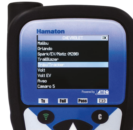
Select the vehicle's MODEL